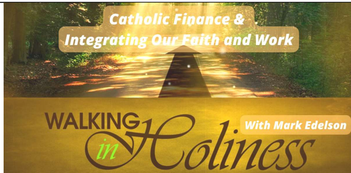
St. Francis de Sales

Thursday, January 26th; 7:00PM St. John the Evangelist Parish House 67 Murray Ave. Goshen, NY