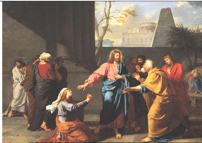
Le Christ et la Cananéenne-Christ and the Canaanite Woman