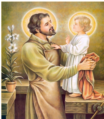
St. Joseph pray for us!