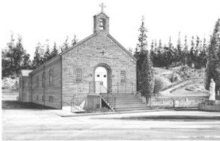
Old St. Joseph's Catholic Church & Shrine Built 1888, 1890, 1891, 1892, 1893, 1894, 1895, 1896, 1897, 1898, 1899, 1900, 1901, 1902, 1903, 1904, 1905, 1906, 1907, 1908, 1909, 1910, 1911, 1912, 1913, 1914, 1915, 1916, 1917, 1918, 1919, 1920, 1921, 1922, 1923, 1924, 1925, 1926, 1927, 1928, 1929, 1930, 1931, 1932, 1933, 1934, 1935, 1936, 1937, 1938, 1939, 1940, 1941, 1942, 1943, 1944, 1945, 1946, 1947, 1948, 1949, 1950, 1951, 1952, 1953, 1954, 1955, 1956, 1957, 1958, 1959, 1960, 1961, 1962, 1963, 1964, 1965, 1966, 1967, 1968, 1969, 1970, 1971, 1972, 1973, 1974, 1975, 1976, 1977, 1978, 1979, 1980, 1981, 1982, 1983, 1984, 1985, 1986, 1987, 1988, 1989, 1990, 1991, 1992, 1993, 1994, 1995, 1996, 1997, 1998, 1999, 2000, 2001, 2002, 2003, 2004, 2005, 2006, 2007, 2008, 2009, 2010, 2011, 2012, 2013, 2014, 2015, 2016, 2017, 2018, 2019, 2020, 2021, 2022, 2023

Wow! Thank you so much to everyone who has contributed to the ACA. We have reached 65% of our goal with the help of 29% of our parishioners. Last year we had a total of 29% participation, perhaps this year we will have more? We are truly grateful for all your support.