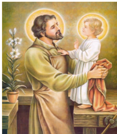
St. Joseph Pray for us!