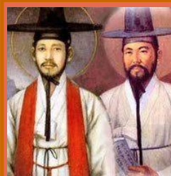
Saints Andrew Kim Tae-gon, Priest, and Paul Chong Ha-sang, and Companions, Martyrs