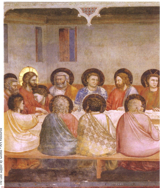
The Last Supper by Giotto