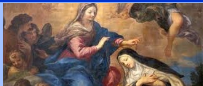
Saint Mary Magdalene de'Pazzi Thursday May 25th

Mary Magdalene de'Pazzi, † 1607; Carmelite mystic of Florence who led a hidden life of prayer and self-denial, praying particularly for the renewal of the Church and encouraging her fellow sisters in holiness; instrumental in the reform of her Order.