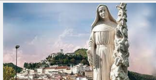
Saint Rita of Cascia, Religious Monday, May 22nd

Rita was born in 1381 in the town of Roccaporena in Umbria. She lived with a brutal husband and had two sons. After the violent murder of her husband, she urged forgiveness in contrast to the customary vendetta of her day. Becoming an Augustinian nun, she spent some forty years in prayer, contemplation, and service to the sick and poor. Toward the end of her life, she received a wound from a thorn from the crown of thorns. She died in 1457. She is the patron saint of those in desperate situations.