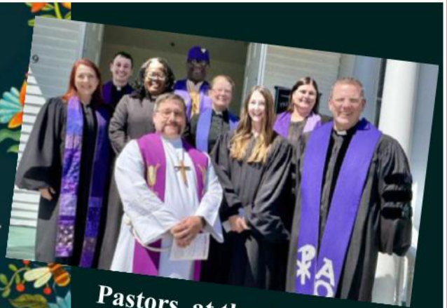
Pastors at the Interfaith Lenten Services