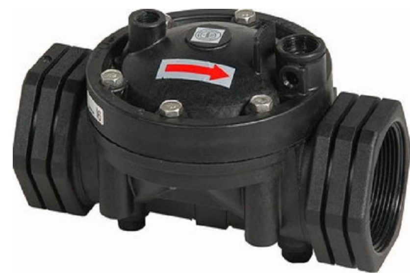
2" DOROT RE-CIRCULATION VALVE