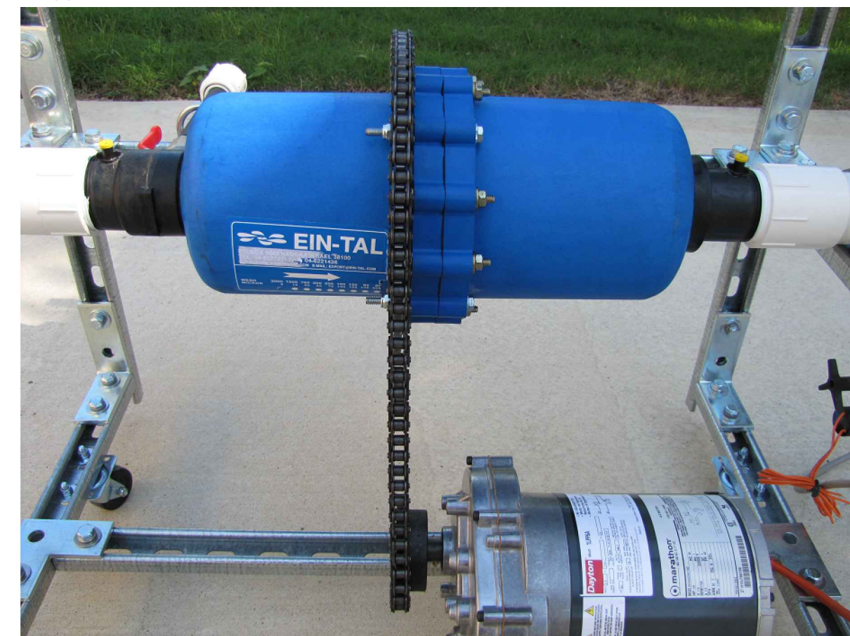
AUTOMATED SCANNING DISC FILTER