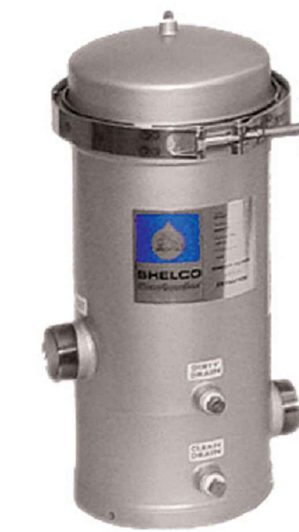
20 GPM 1MICRON MULTI CARTRIDGE FILTER