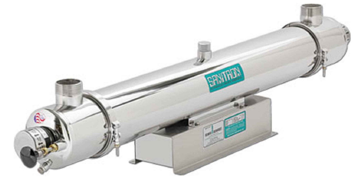
20 GPM UV FILTRATION