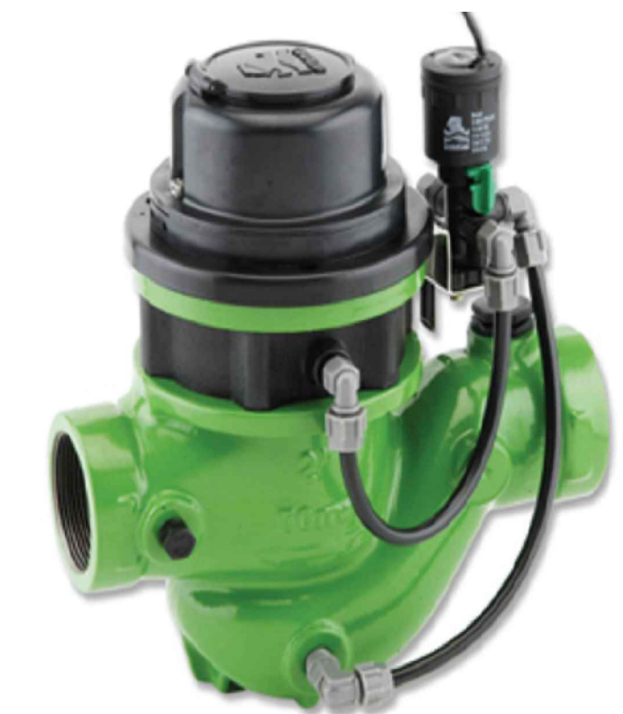
1 1/2" BERMAD MASTER VALVE AND FLOW METER