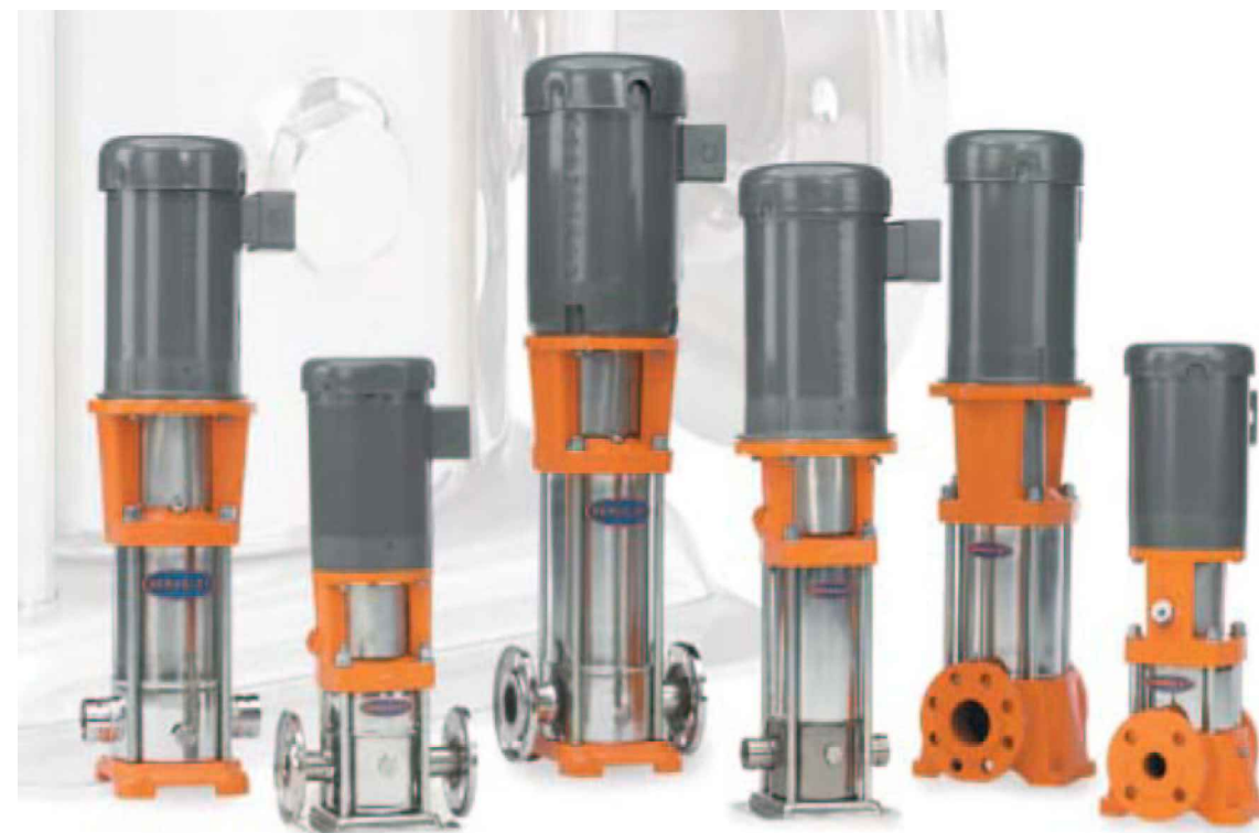
VERTICAL MULTI STAGE PUMPS