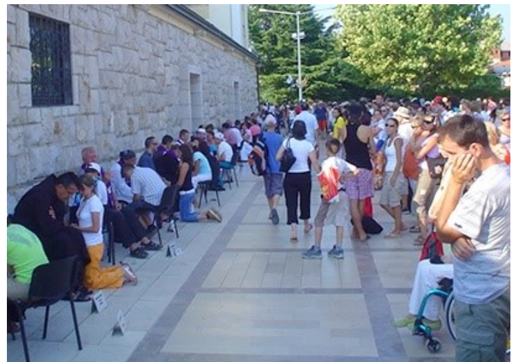
Confession in Medjugorje in multiple languages

February 25, 2007 "Dear children! Open your heart to God's mercy in this lenten time. The heavenly Father desires to deliver each of you from the slavery of sin. Therefore, little children, make good use of this time and through meeting with God in confession, leave sin