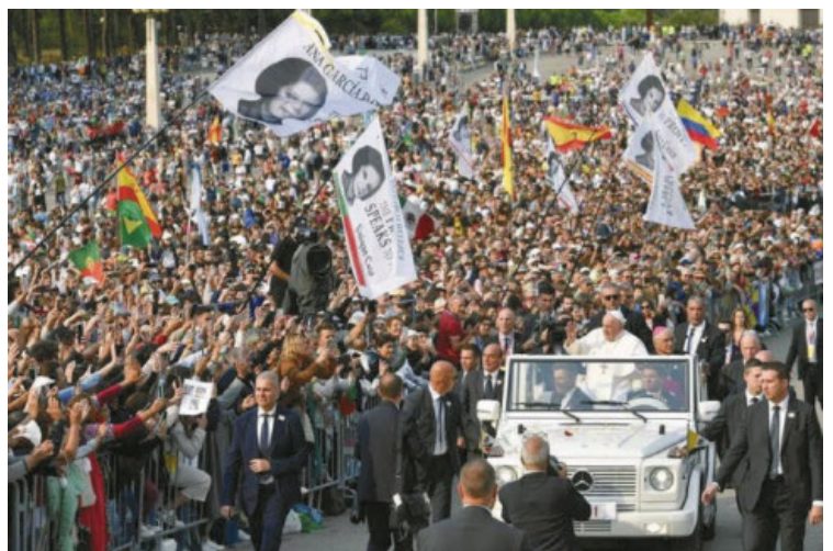
An estimated 200,000 people attended the pope's rosary in Fatima, Portugal, on Aug. 5, 2023.

Omella said he was "really struck" by other testimonies that took place during WYD from young people who "have also recovered their interior vision."