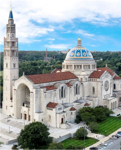
The Shrine of the Immaculate Conception in Washington D.C.

On October 13, 1956, Our Lady again appeared as Our Lady of America, but instead of a lily in her hand, she held, with both hands, a small replica of the finished Shrine of the Immaculate Conception.