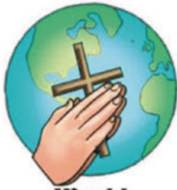
World Mission Sunday

NEXT WEEKEND we will celebrate World Mission Sunday. Pope Francis invites the entire Church to support mission dioceses in Africa, Asia, the Pacific Islands, and parts of Latin America and Europe, where priests, religious and lay leaders serve the world's most vulnerable communities. Please keep the Pope's missions in your prayers and be generous in next week's collection for the Society for the Propagation of the Faith.