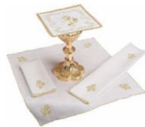
Ladies of St. Joseph Marelo Parish

Due to upcoming holiday print deadlines, please get bulletin announcements in at least two weeks beforehand. Thank you!