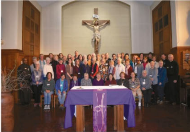
TIME FOR OUR WOMEN'S RETREAT