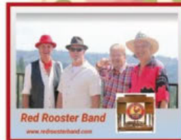
Red Rooster Band www.redroosterband.com