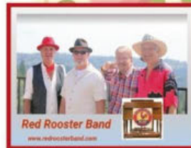
Red Rooster Band