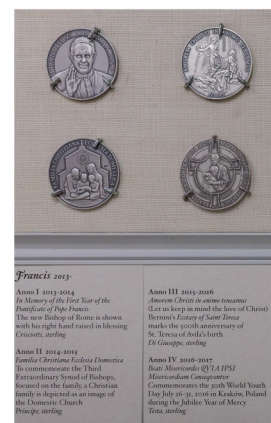
Coins highlighting the pontificate of Pope Francis on display.

The Blessed Michael McGivney Pilgrimage Center in New Haven is welcoming visitors to view a permanent gallery that highlights the relationship between the Knights of Columbus, Pope Francis and other pontificates.