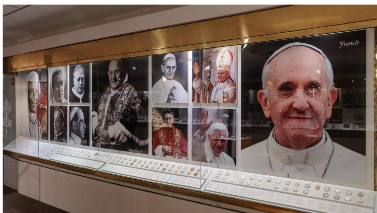
The Papal Gallery, inside the Blessed Michael McGivney Pilgrimage Center, includes a permanent exhibit related to popes. At right is a photograph of Pope Francis.