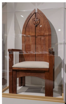
This Papal Chair was used by Pope Francis during the 2016 World Youth Day in Krakow, Poland.