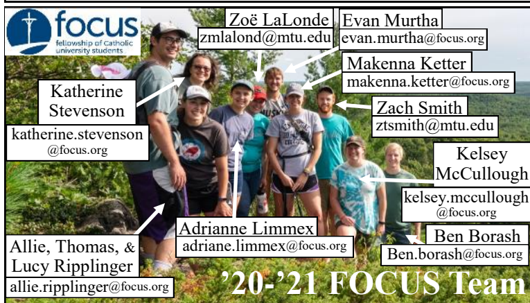
'20-'21 FOCUS Team