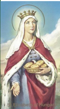
St. Elizabeth of Hungary

Saint Elizabeth of Hungary is the Patron Saint of bakers, Catholic Charities and the Secular Franciscan Order