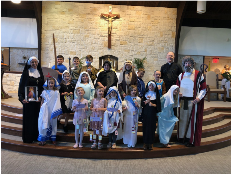
The elementary CCE students blessed us with a beautiful All Saints Day Celebration on Sunday, November 1.