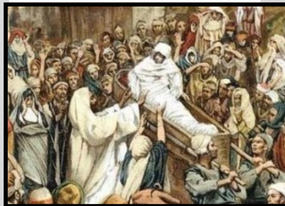
The Resurrection of the Widow's son at Nain by James Tissot