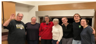
Wednesday Cooking Team

The Next Meal Date: We will be cooking at St. Anne Parish Hall on Wednesday, January 21 and serving for OFT in Marlboro on Thursday, January 22.