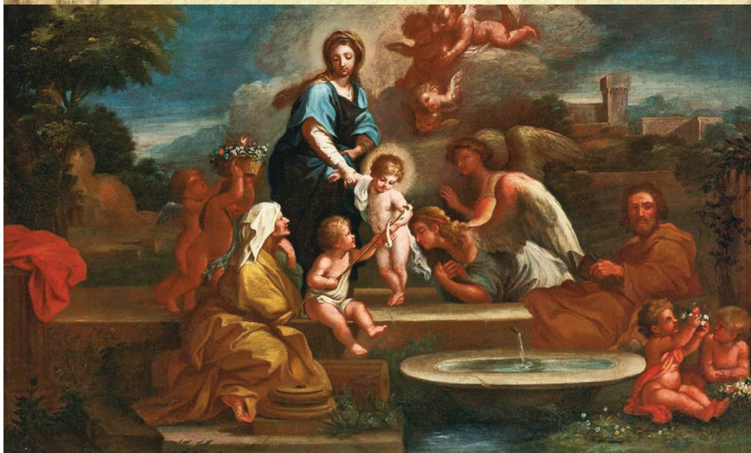
Holy Family with Angels in a Landscape, Luigi Garzi