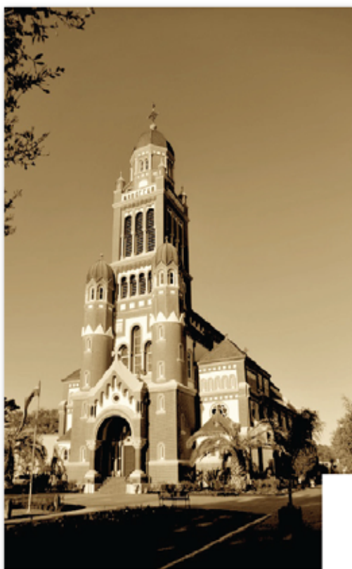
Cathedral of St. John the Evangelist

With Mary's protection and a homegrown bishop, the Diocese of Lafayette was formed, with forty-eight church parishes serving around 153,000 Catholics, to continue the work of proclaiming the Gospel of Jesus Christ in Acadiana.