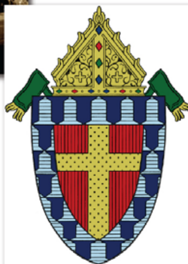
Crest of the Diocese of Lafayette