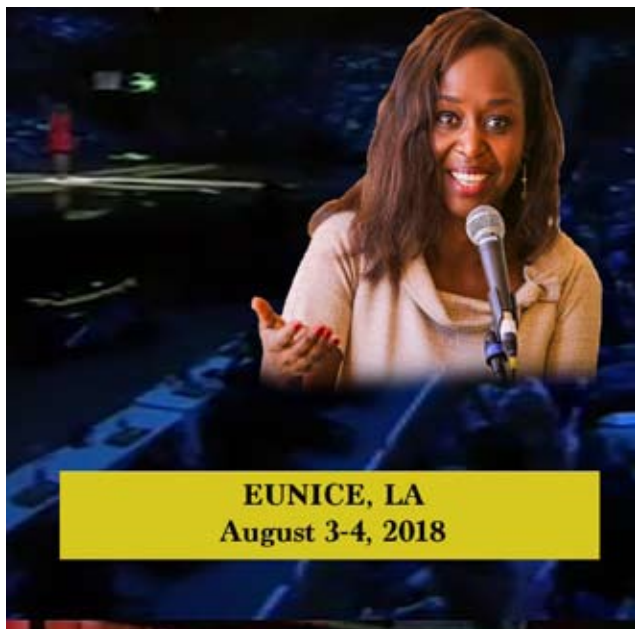
EUNICE, LA August 3-4, 2018

8:00 a.m. First Saturday Mass 9:00 - 10:30 a.m. Session 3 10:30 - 11:00 a.m. Break 11:00 - 12:30 p.m. Session 4 / Conclusion