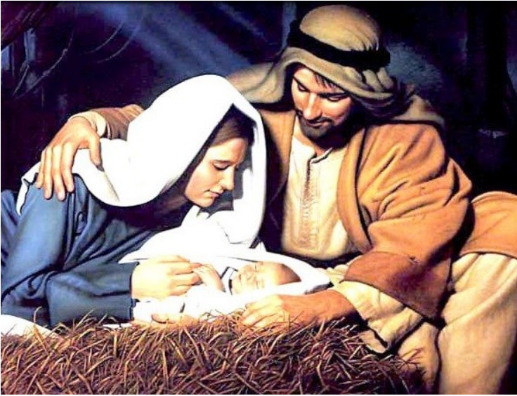
One Holy Family in Christ

"All power in heaven and on earth has been given to me.