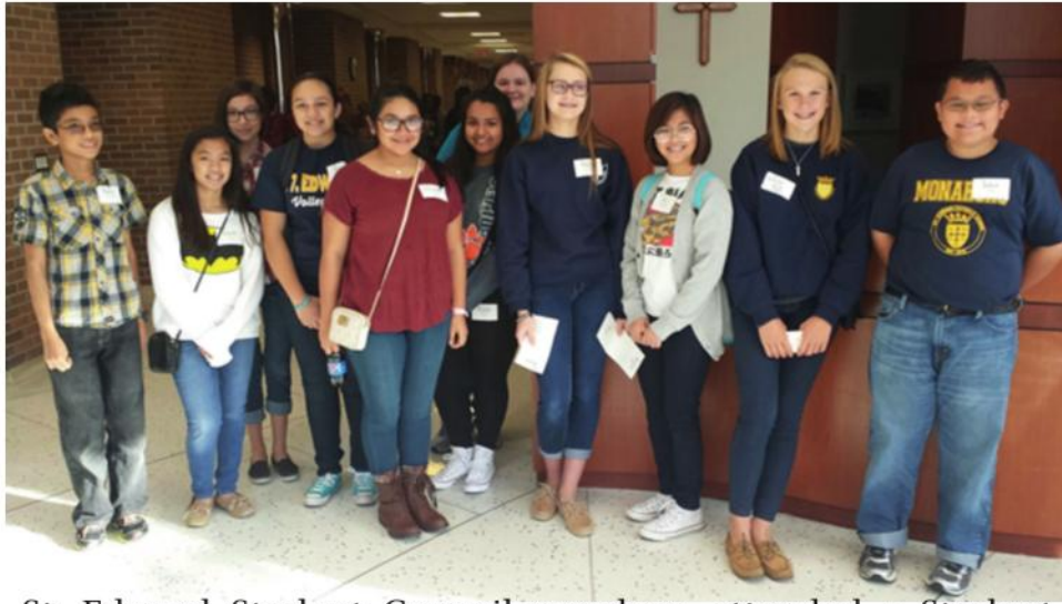
St. Edward Student Council members attended a Student Council Workshop at St. Agnes.