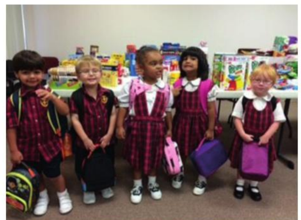
St. Edward School recently collected over 45 boxes of essential items for troops in Kuwait. The students enjoyed the responses from the soldiers – all the boxes were gone within an hour!