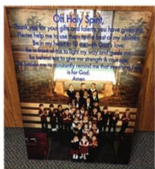
Pre-K 3 & 4

Each homeroom class from Pre-K to 8th grade has created a unique and beautiful project for the Diamonds & Denim Casino Night & Auction on May 6, 2017. There are intricate crosses, blankets featuring class members, a gorgeous rosary, a photo display featuring words spelled out with students' hands, a whimsical chess set, two incredible Adirondack chairs, and a delicate wire-sculpted tree with an Irish blessing embroidered on black velvet. Thank you, room parents and students, for these special items! Please visit www.stedwardfundraising.org/auction for more information about tickets to this special evening and to bid on these class projects.