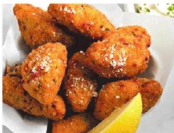
Crispy Fried Artichokes