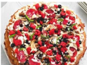
BJ's Favorite Deep Dish Pizza

Valid for dine in or take out. Not valid towards alcoholic beverages or Happy Hour specials. Please do not distribute flyers on-site during the event. Flyers must be printed and presented to the server.