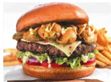
Crispy Jalapeño Burger