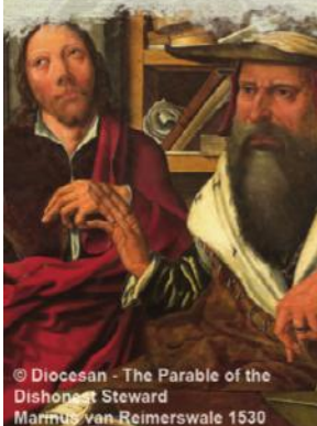
The Parable of the Dishonest Steward Maurus van Reimerswale 1530