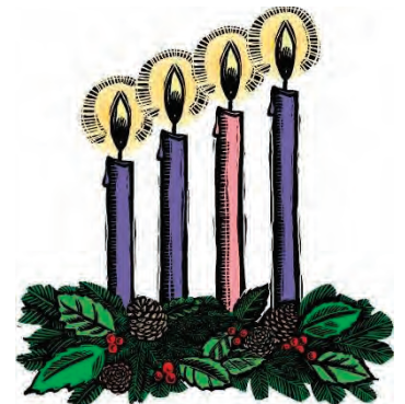
Fourth Sunday in Advent

This fourth Sunday of Advent, we light the fourth candle on the Advent Wreath. The last purple candle is the Angel's candle and symbolizes Peace. As we enter this fourth week of Advent, we begin our final preparations for Christ's coming on Christmas day. One of the most important things we must do these last few days of Advent is to ask ourselves, 'What do I truly believe?' The Christmas season is filled with so much hope, love, joy, and peace but also the craziness of shopping, baking, planning, decorating – it's so easy to lose sight of the true meaning of why we are celebrating in the first place. Especially during the chaos that can come with Christmas, time seems to fly by, and you are probably finding yourself searching for some peace and quiet. I encourage you to take time out of your busy schedule to look, listen and ponder the fact that Jesus, our one true Messiah, is the foundation for this celebration. When we light each candle on the Advent wreath, we are acknowledging that Christ is the light that enables us to share and celebrate the love and compassion of God. Although things can get overwhelming this time of year, it is so important to slow down, lean on Christ and share in the true meaning of this Christmas season. The Messiah is near, He is only a few days away. These last few days of Advent I encourage you to use the gifts God has blessed you with to share the light and peace of God with others.