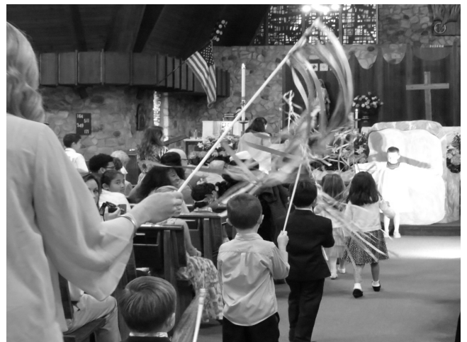
He is Risen! Jubilation at the Easter Sunday Children's Mass