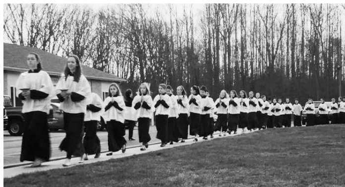
Altar servers process at Holy Thursday services.