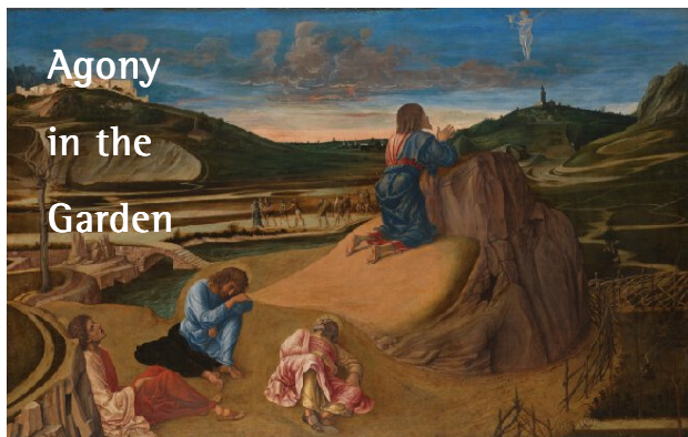
Agony in the Garden