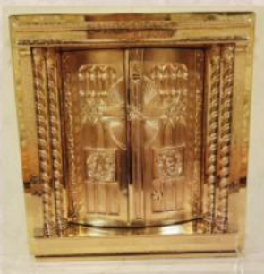
Alpha Et Omega Tabernacle Doors (Entrance Side) $10,000