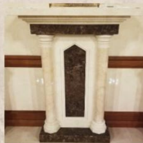
Tabernacle Altars (2) $15,000 each