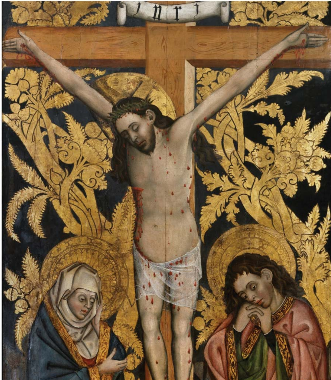
The Crucifixion SÁNCHEZ, JUAN Museo Nacional del Prado, Madrid