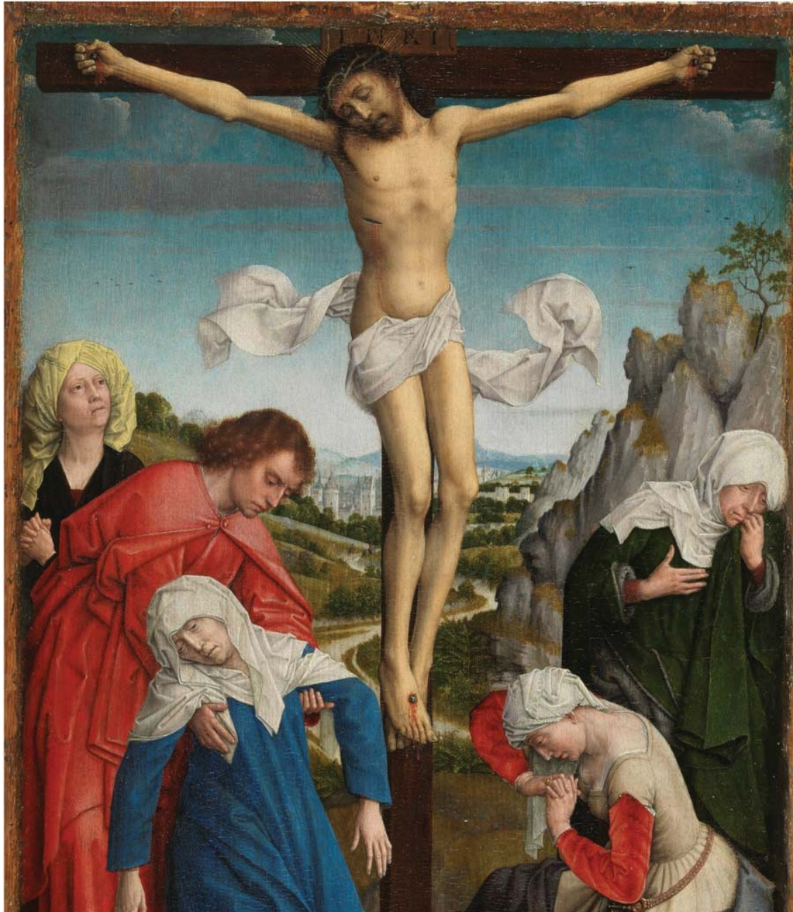
The Crucifixion WEYDEN, ROGIER VAN DER Museo Nacional del Prado, Madrid