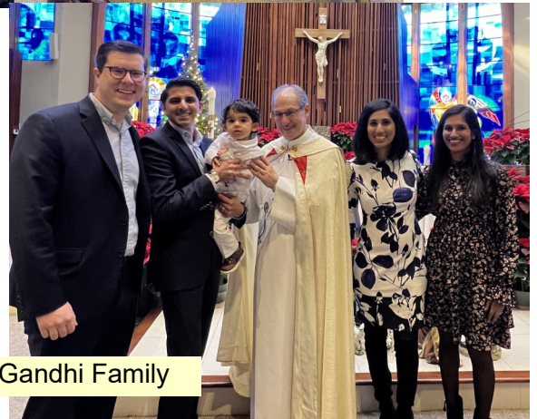
The Gandhi Family