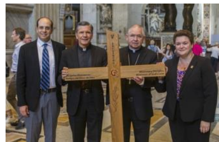
Fifth National Encuentro gathering, both coming up in 2018.

"He did that in very short order. He talked to me about that two years ago, that he wanted to create a university and so when I was there in January, I asked him how those plans were