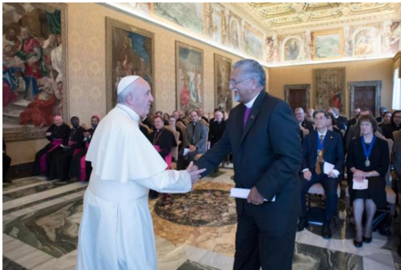
Pope Francis greets Ivan Abrahams, general secretary of the World Methodist Council, during an audience at the Vatican Oct. 19. Members of the World Methodist Council were in Rome to commemorate the 50th anniversary of the formation of the Joint International Methodist-Catholic Dialogue Commission. Oct. 19, 2017.

"When, as Catholics and Methodists, we join in assisting and comforting the weak and the marginalized -- those who in the midst of our societies feel distant, foreign and alienated --