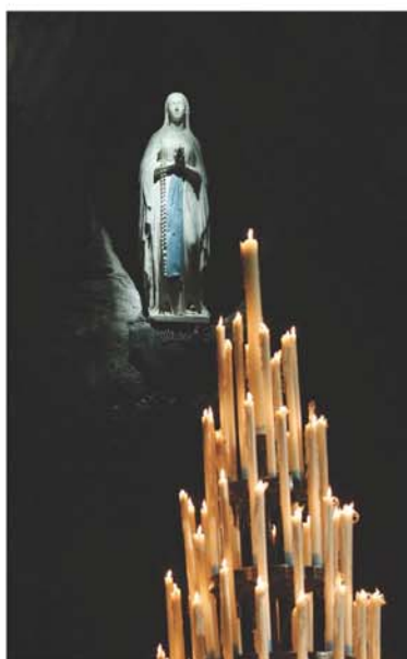
Candles burn in front of the statue of Mary at the grotto at the Shrine of Our Lady of Lourdes in southwestern France.

St. Bernadette's accounts of seeing a heavenly vision of