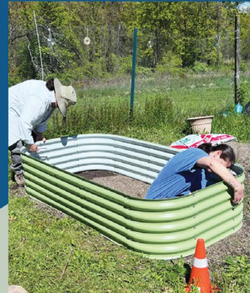
Above, sisters and associates are updating the garden at Mt. St. Joseph.