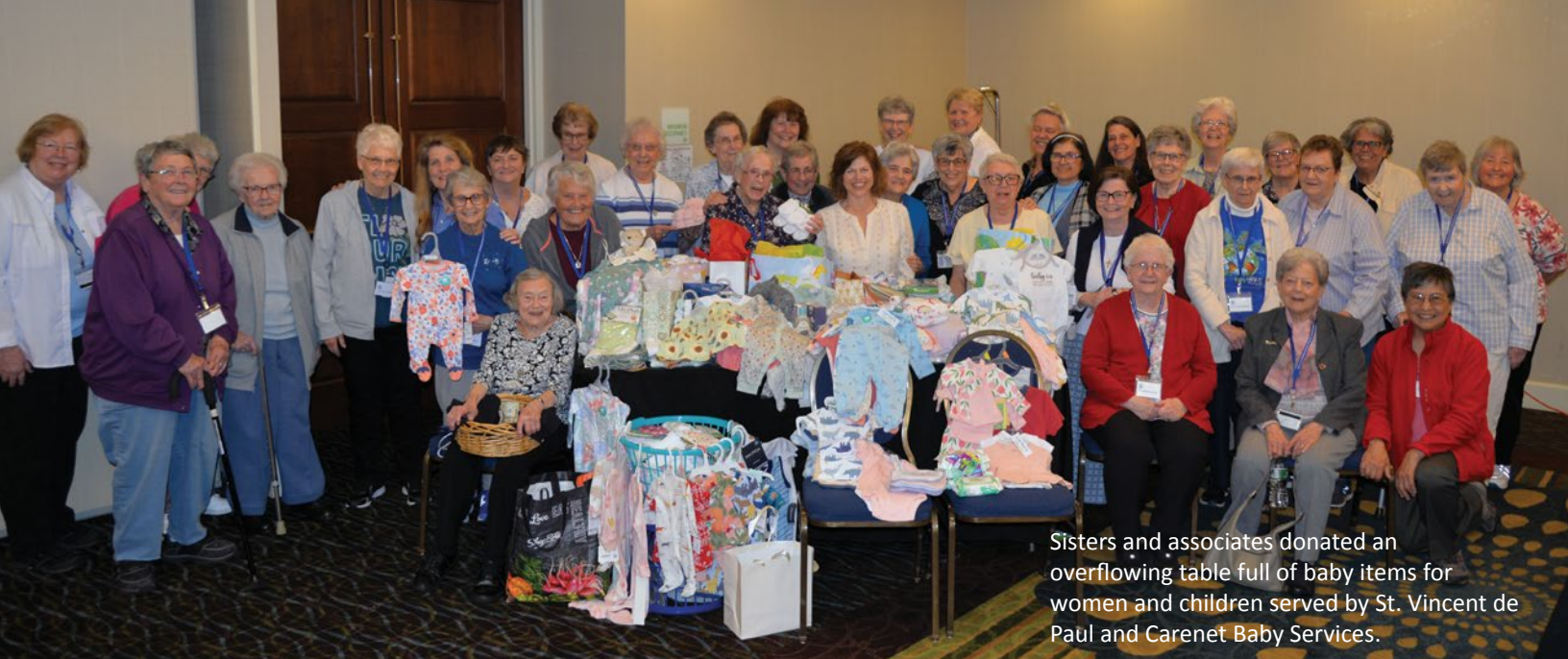
Sisters and associates donated an overflowing table full of baby items for women and children served by St. Vincent de Paul and Carenet Baby Services.