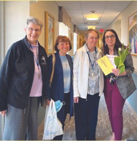
Below, staff from St. Bernard's school visited the sisters at Notre Dame du Lac.