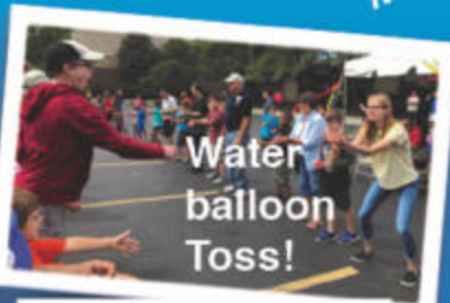
Water balloon Toss!