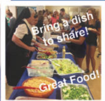
Bring a dish to share! Great Food!