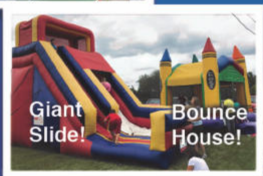
Giant Slide! Bounce House!