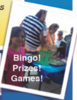
Bingo! Prizes! Games!