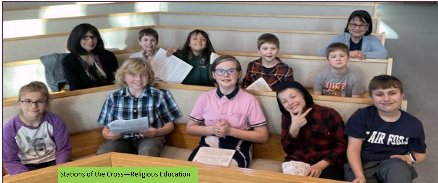
Stations of the Cross—Religious Education