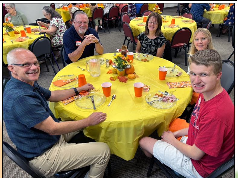
New Parishioner Welcome Luncheon - 10/8/2023

Bring photos into the office for scanning, or email a copy to stjosephcolbert@dioceseofspokane.org