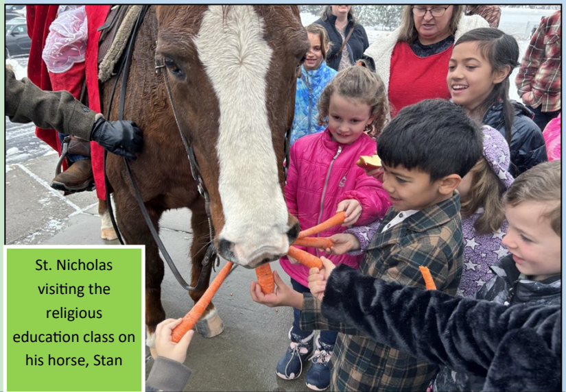
St. Nicholas visiting the religious education class on his horse, Stan