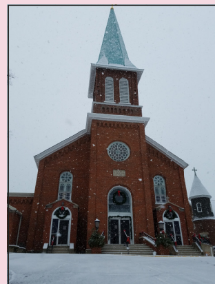
St. Joe Hill Chapel 2605 St. Joe Road West Sellersburg, IN 47172 (812) 246-2512

Chapel Decorating: Sunday, December 23 10:30am St. Joe Hill Chapel / 12:15pm St. Paul Chapel