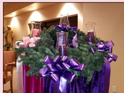
St. Paul Chapel 216 Schellers Avenue Sellersburg, IN 47172 (812) 246-3522

Website: stjohnpaulparish.org Facebook: St. John Paul II Parish Bulletin Deadline: Mondays 9am; Email bulletin@stjohnpaulparish.org , or call either parish office.