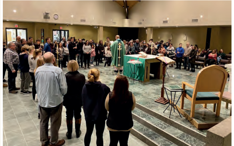
9th Grade Rite of Welcome at the 6 pm Mass