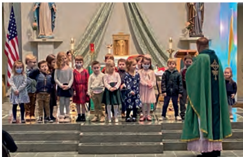
Our Pre-School Family Mass