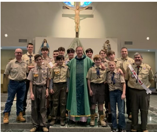
Washington Township Scouts celebrate Scouting.