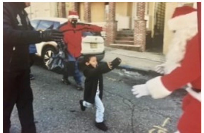
Thanks to our CCD children who donated gifts on White Gift Sunday and to the Knights of Columbus for delivering happiness.