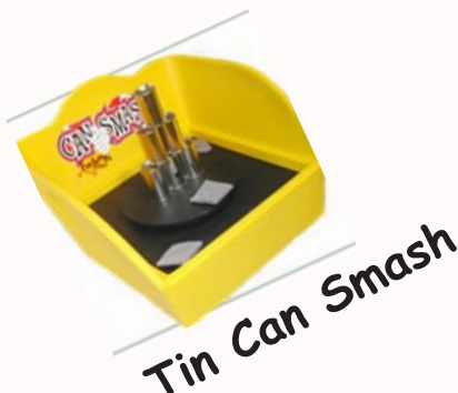
Tin Can Smash

Anti Gravity Drop Boulder Roll Crazy Dots Stand A Bottle