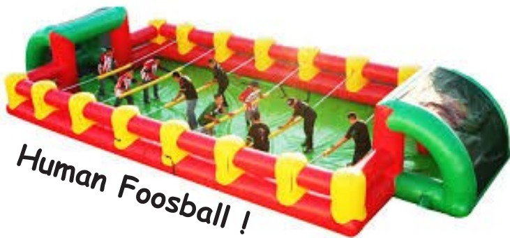
Human Foosball !