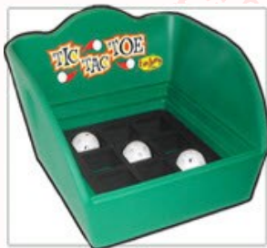
Wiffle Ball Tic-Tac-Toe

Anti Gravity Drop Boulder Roll Crazy Dots Stand A Bottle